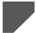
End Cap (D)